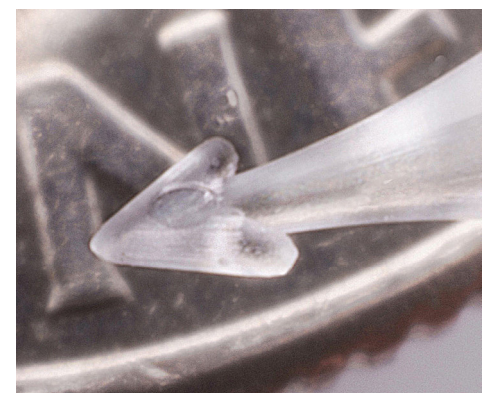
Bioresorbable tissue anchor with better than .0045” radius on end of barb

Finally, because we have over 100 years of experience as well as a commitment to quality and to developing long-term partnerships with our customers, you can be confident in Paragon Medical as your manufacturing partner.